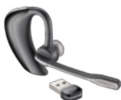
Voyager® Family Bluetooth® headsets for computer/mobile users