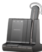
Savi® Family Office wireless headsets for computer/mobile users