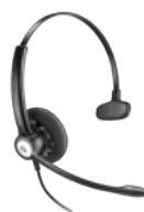
Blackwire® Family USB corded headsets for computer users